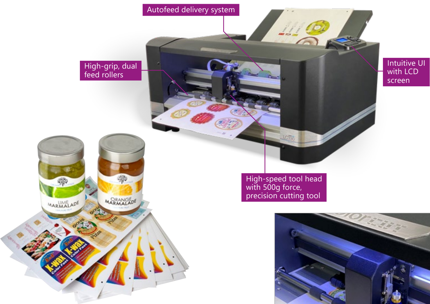
Kiss-cut sheet label media